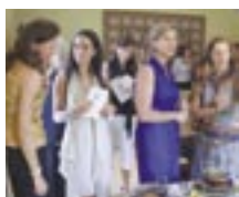
The First Annual Caring Tea