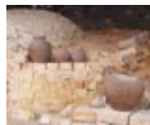
Dragon Kiln @ Jungle Pottery