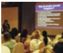
Feng Shui for Your Home